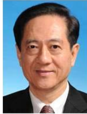
HAN Qide, Vice Chairman of Chinese Congress