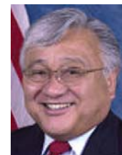
Honorary Chairman: Mike Honda U.S. Congressman and Vice Chair of Democratic National Committee